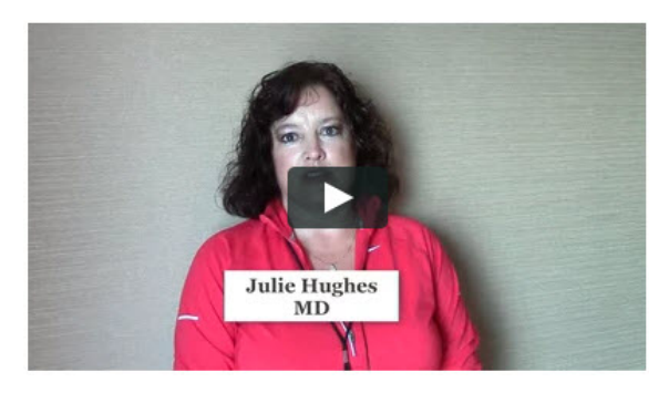
[complete testimonials here]

It is with front-line leaders like you that the Quadruple Aim will live or die in the organization. [And we are well aware you may - or may not - be getting paid or have protected hours for your leadership activities currently. Negotiating for time and money will be one of the topics we cover at the retreat.]